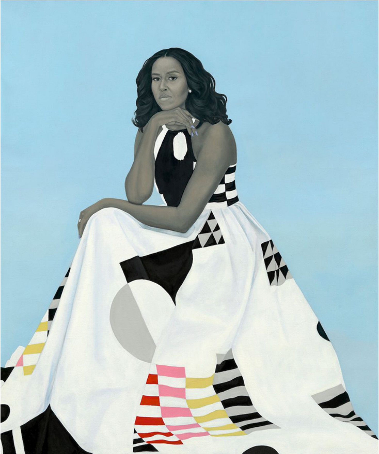
Michelle LaVaughn Robinson Obama / Amy Sherald / 2018