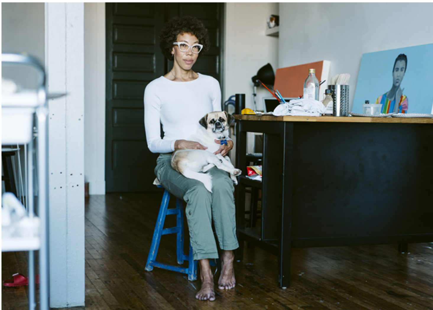
Amy Sherald at her Baltimore, Maryland studio with her dog August