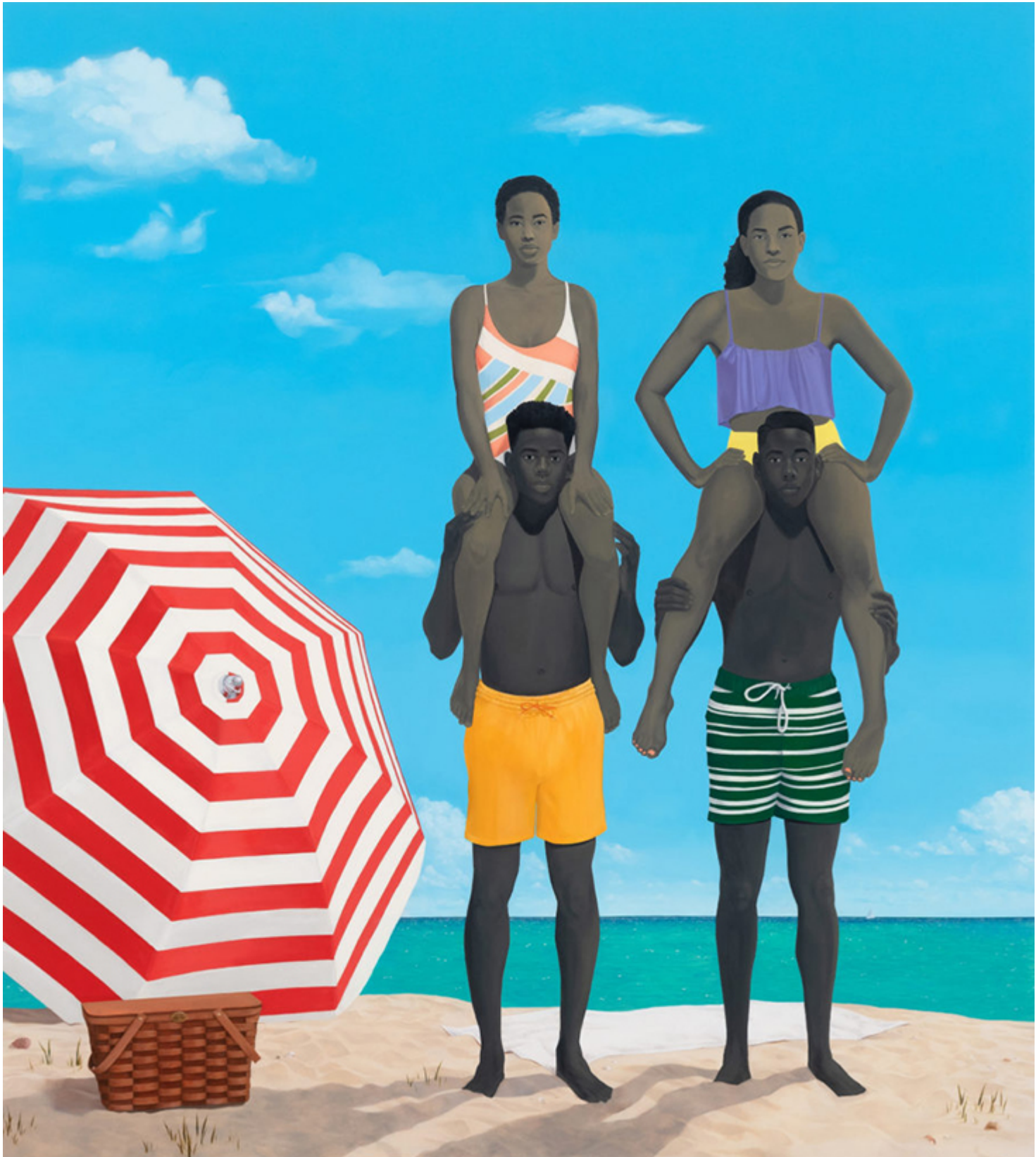
Precious jewels by the sea / Amy Sherald / 2019

In the same year, Sherald won the 2018 David C. Driskell Prize from the